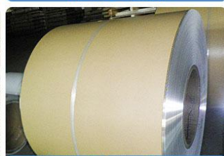
Polykraft Moisture Barrier