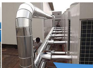
aluminum jacket for pipe insulation