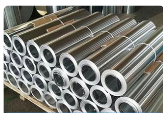
Plain Jacketing roll