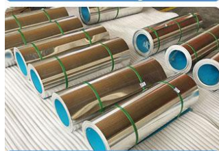
Polysurlyn Moisture Barrier